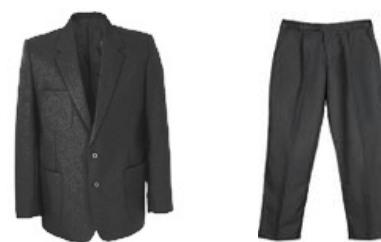
Suit Jacket Trousers for jacket

A note on Secondary PE Kit: the PE Kit made and ordered from Canterbury will no longer be the mandatory KSA PE Kit; it is being replaced by the sports polo (navy) and tracksuit bottoms (navy) available from Stitch Design. However, if pupils do have full and correct KSA Canterbury PE Kit they can continue to wear this for PE Lessons.