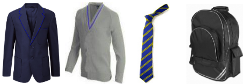
KSA Blazer Knitted v-neck jumper Middle School tie KSA Senior backpack