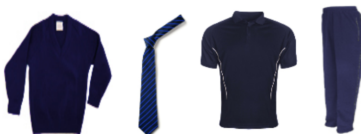
Knitted v-neck jumper Upper School tie Sports Polo Tracksuit bottoms

Pupils in Year 7 to Year 10 also need dark-grey trousers, dark-grey or black socks, a plain-white shirt and smart, black shoes which can be purchased elsewhere. Year 10 pupils may wish to wear the grey trousers which were part of the Upper School suit and these are also available at Stitch Design.