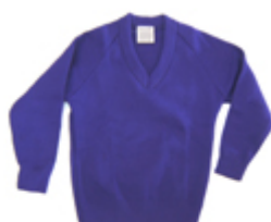
Knitted v-neck jumper